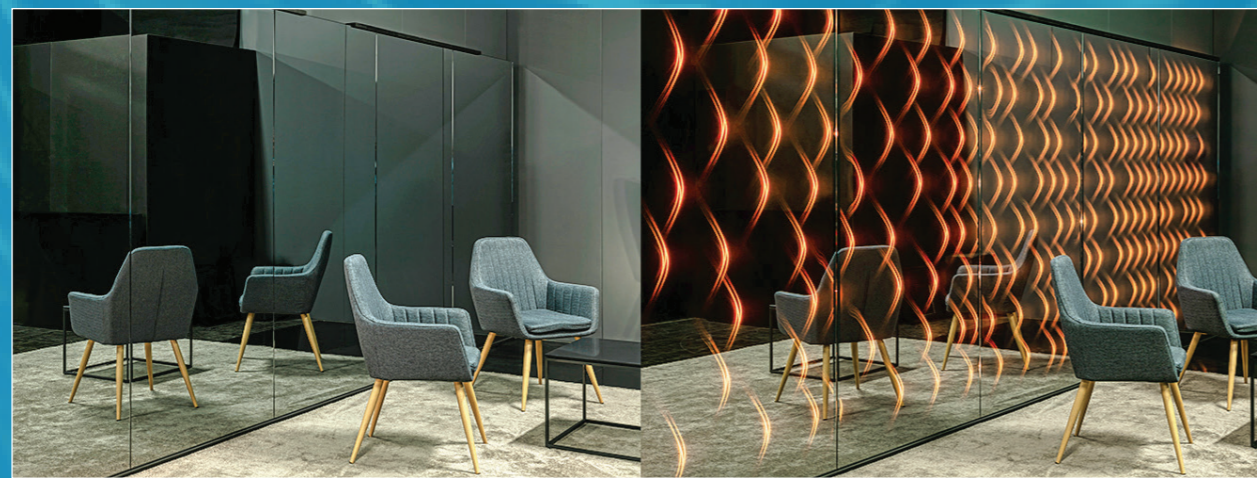
Mirror with 3D lightning effect

We tend to give more licence to interior designers when it comes to their more daring work than we would ever give to the technical pioneers serving our market. Yet these engineers are the architects of superb AV experiences, creating the breakthrough technologies that fuel innovation in the marine AV sector. Some of the most exciting solutions are created when experts from different disciplines work together. This is especially true of private cinemas, where the quest for high performance and exquisite aesthetics yields ground-breaking results.